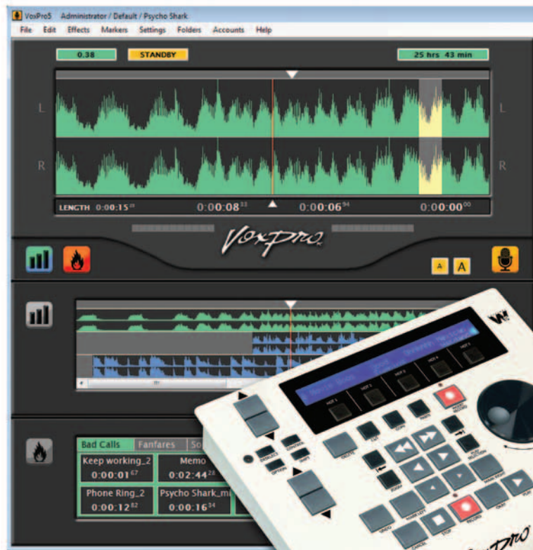
Wheatstone acquired Audion Labs and its VoxPro product line last fall.

Touring artists do advance promotional calls for upcoming cities, but can devote only a few minutes to each station. If they