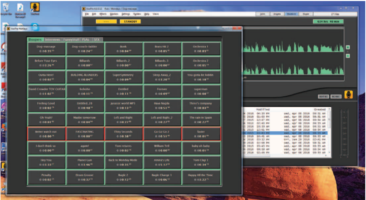
This image shows VoxPro6 with floating Hotkeys window on top.

He then edits out the set-up on each call, flies in the beep, and airs a montage consisting of each caller blurting out their choice, separated by the tone burst. “It really gets