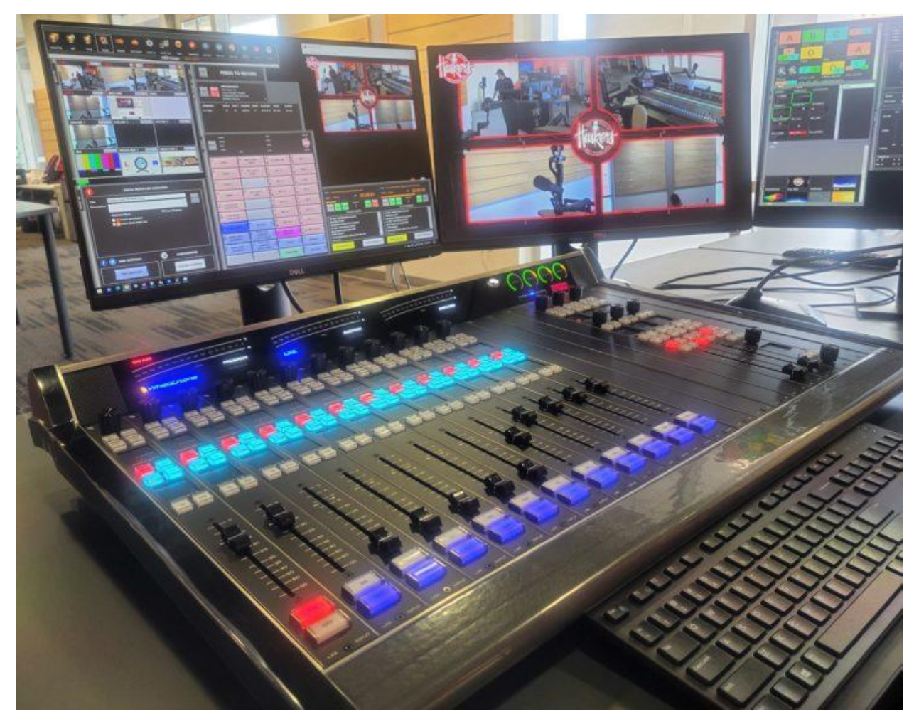
A producer position to monitor and operate the HDVMixer video production system

"With Wheatstone LXE and AoIP technology, we can easily generate custom mixes, and adjust any needed audio processing for each and every road game microphone while mixing at the Huskers Broadcast Center."