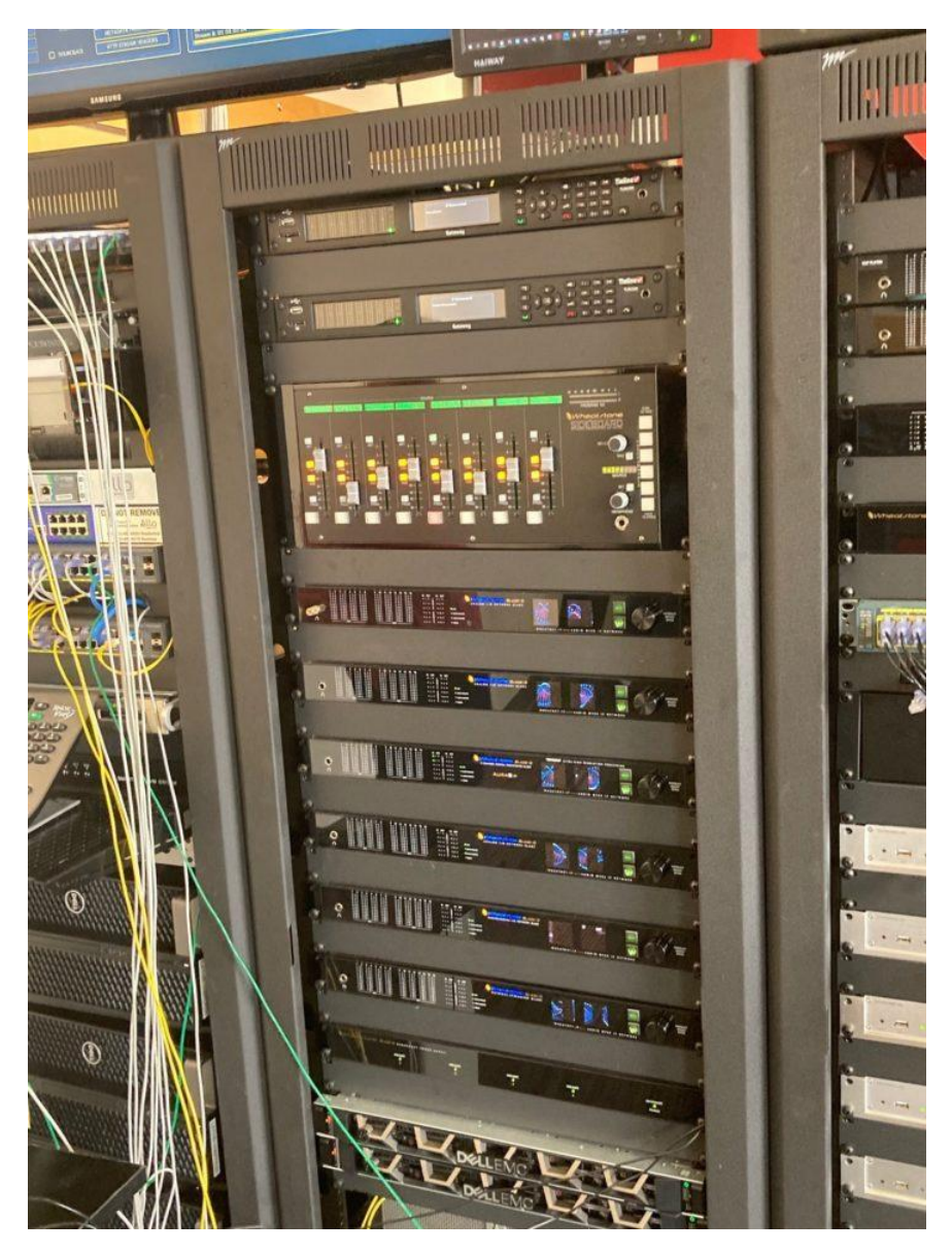
Tieline and WheatNet equipment is visible in the rack area

The timeline to complete this project was remarkable, especially given current supply chain challenges.