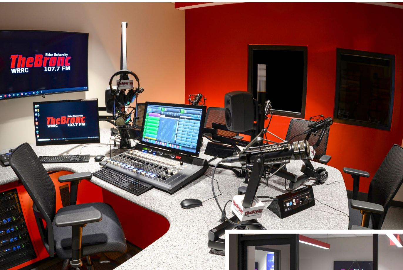
Left 107.7 The Bronc's on-air studio.